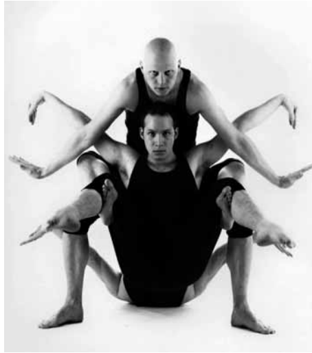
Fiesta Latina, including a performance by Galumpha, takes place June 13.

World famous performance art troupe, Galumpha ( www.galumpha.com ) has once again joined the Hispanic Liaison's Fiesta Latina line-up for Saturday, June 13, 12 - 7 p.m. at Shakori Hills Farm ( www.shakorihills.org ). This represents