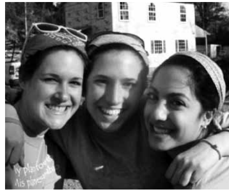
Students volunteers from Villanova University working in Chatham during Spring Break 2009.