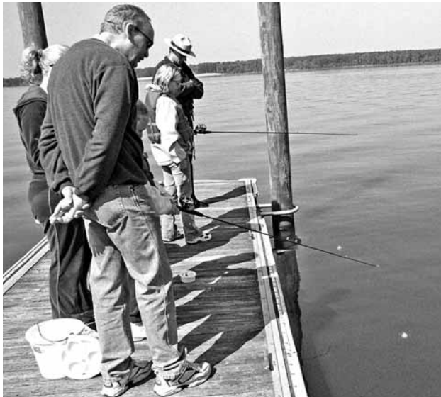
A park ranger leads a fishing class on the fishing pier on Jordan Lake.