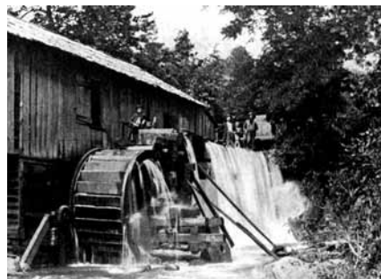
Chatham's turbulent waters Page 6