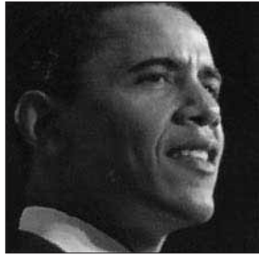
Our next President Barack Obama barackobama.com