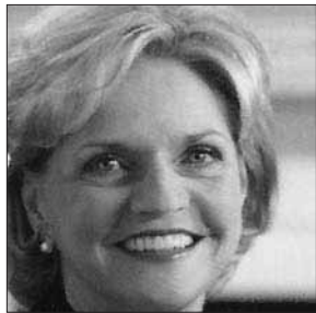
Our next Governor Bev Perdue bevperdue.com