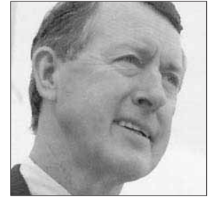
US Congressman Bob Etheridge etheridgeforcongress.org DISTRICT 2