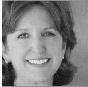
Our next US Senator Kay Hagan kayhagan.com