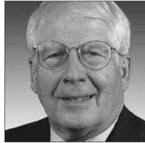
US Congressman David Price davidprice.campaign office.com DISTRICT 4