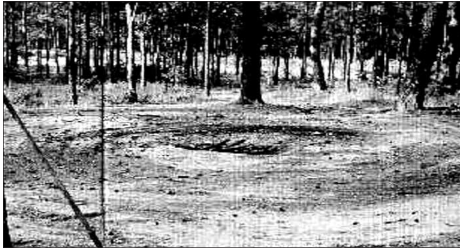
In southwest Chatham lies a 40-foot-wide clearing with a barren circular path known as the Devil's Tramping Ground. Rumors and stories about the patch of land are rampant, especially around this time of year.

Unfortunately the Devil's Tramping Ground has lost its former glory. Recently I saw a circular area of disturbed soil with ash and bits of litter mixed in and a few sprigs of spurge, and no circle, assuming I found it. I had wanted to see the Tramping Ground for a long time, and want to believe it is mysterious, but it seemed no more eerie than any lonely woods, except for its reputation. The trail peters out further on, and I heard the sounds of kids beyond the woods. There were no birds, and reportedly animals avoid the Tramping Ground, but it was also a late summer afternoon when birds are quiet anyway.