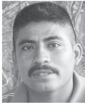
Hombres como Mortadelo no emigran solo por dinero, viajan para probar su calidad laboral.

A su regreso a México al inmigrante no lo esperan comités oficiales de bienvenida. Cruzando las garitas de inmigración quizá se tope con